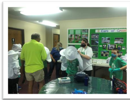
Volunteers helping Caring Hands Campers with suites