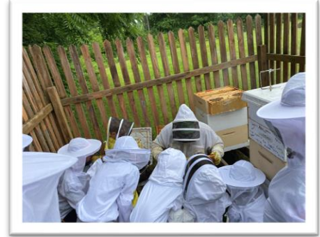
Christ Church Cathedral youth learning about honey bees