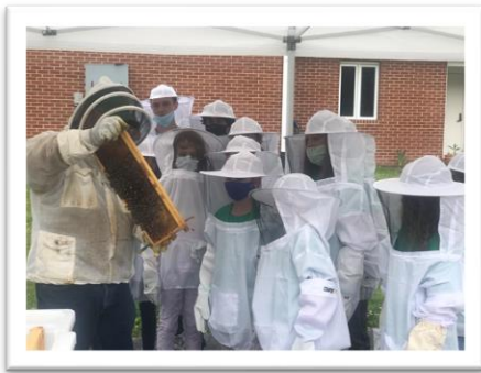
Caring Hands Campers learning about bee in a hive