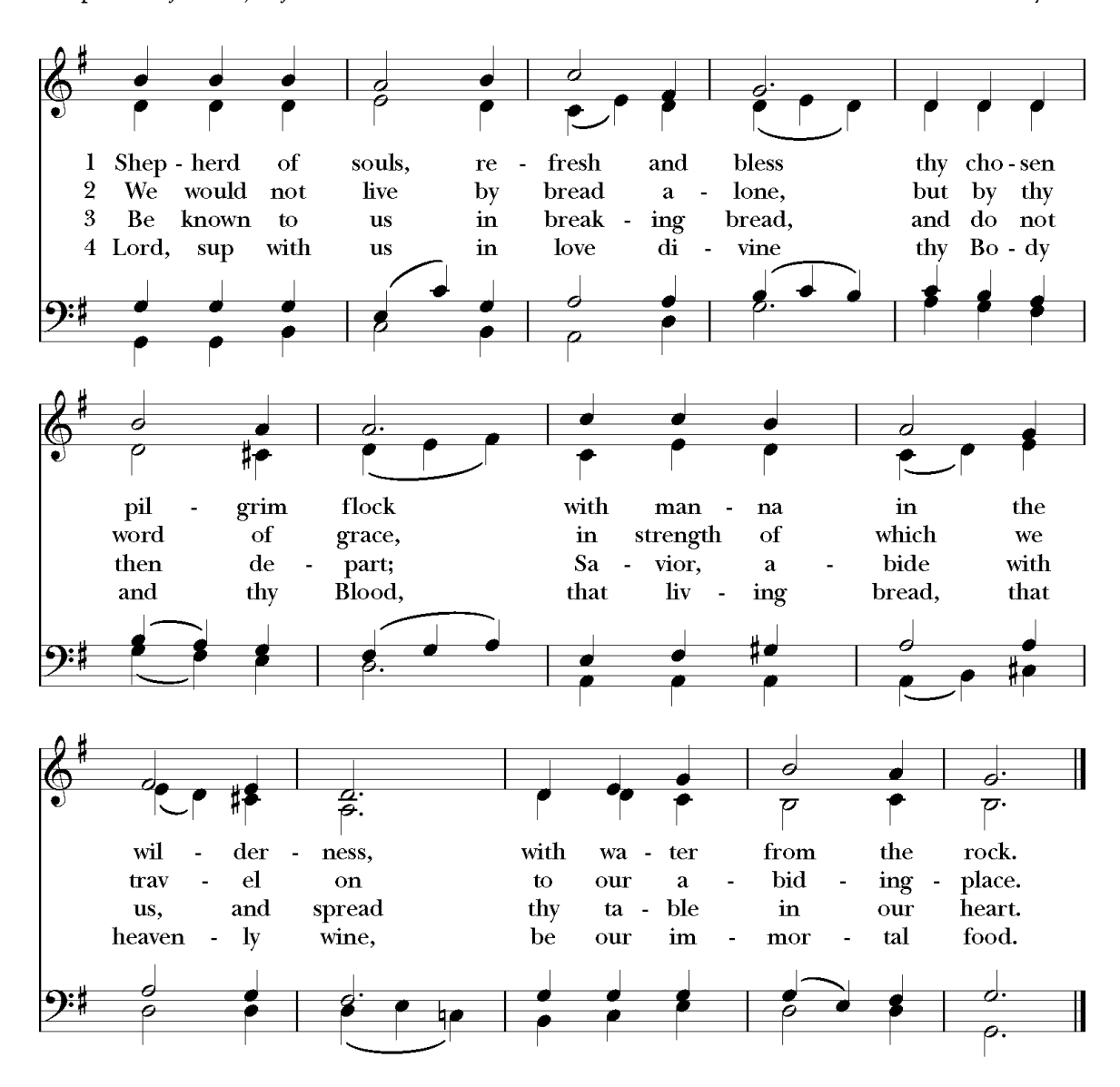
After Communion, the Celebrant says