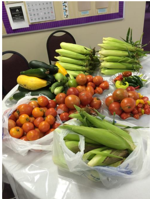
A Bountiful Harvest